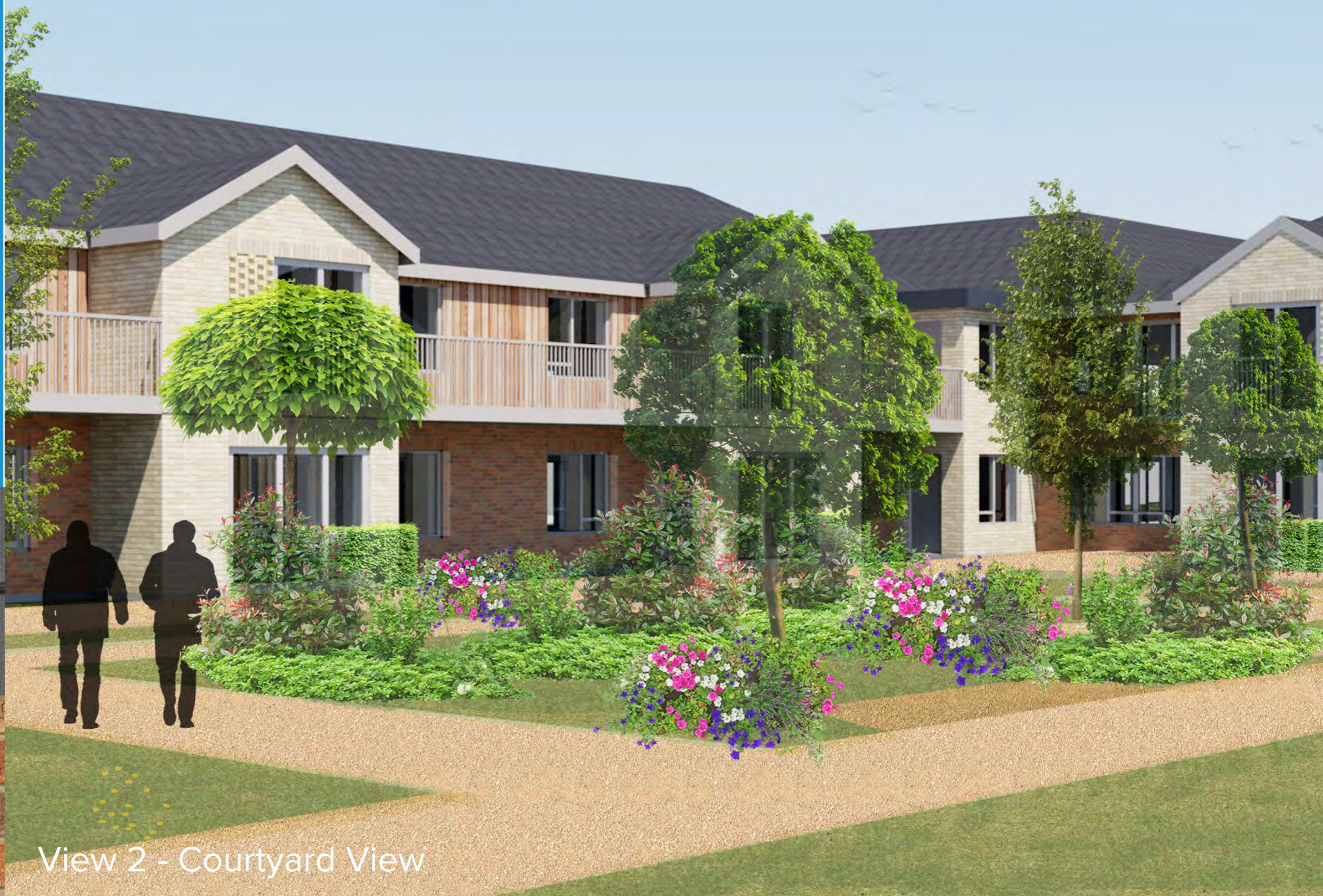
View 2 - Courtyard View